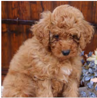
This is Chief

He is very intelligent and well trained. You were also very coordinated and friendly!